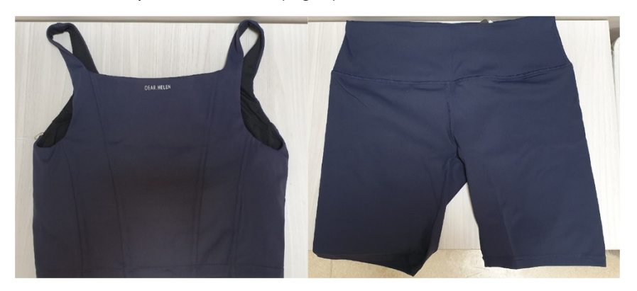
Fig. 2. Activewear that adheres to the body worn during the 3D scanner imaging.

2. Clothing: Any clothing or accessories worn by patients being scanned can interfere with the scanner's ability to accurately capture the body's surface. It's typically recommended that minimal clothing be worn and that all accessories, including jewelry, watch and accessories be removed. Patients were asked to wear form-fitting clothing provided by our department to ensure the most accurate body shape capture. For consistency, all patients were scanned wearing the same type of clothing. Any accessories or bulky items were removed prior to the scan (Fig. 2).