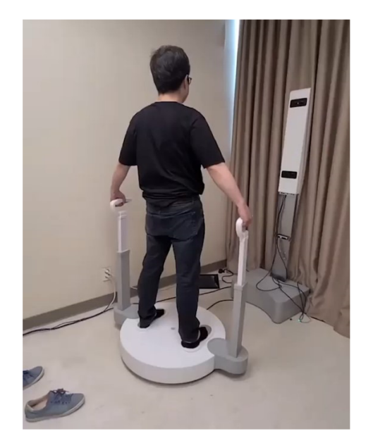
Fig. 1. An example of poses for 3D scanner imaging.

1. Posture: The pose of the patients being scanned can significantly affect the results. Generally, a standard standing pose is adopted, with their feet shoulder-width apart, arms slightly raised, and look forward at a fixed point at eye level. This posture enables a comprehensive 3D body scan, including every aspect of lower extremities (Fig. 1).